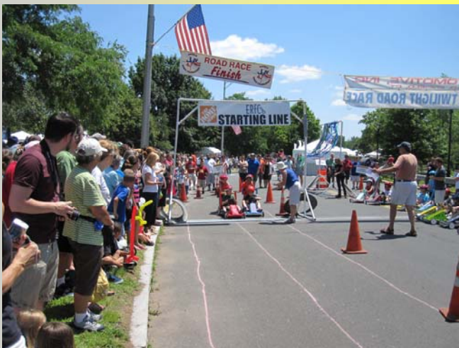
On your mark, get set, GO!!!