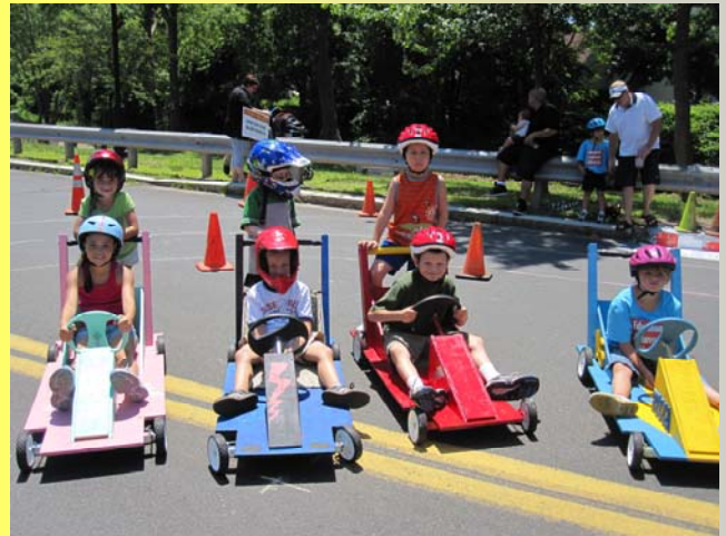
Waiting to race!