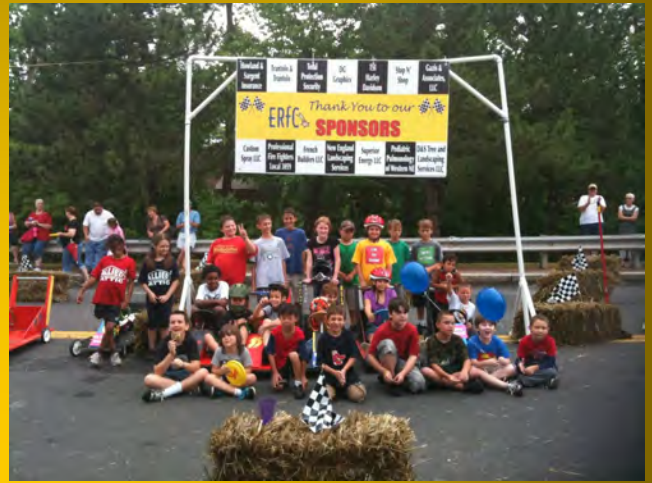
Participants under the Sponsorship Banner.