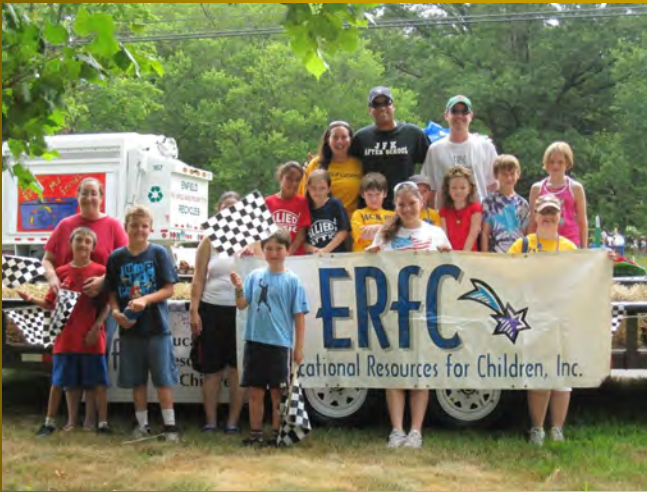
Getting ready for the Parade!